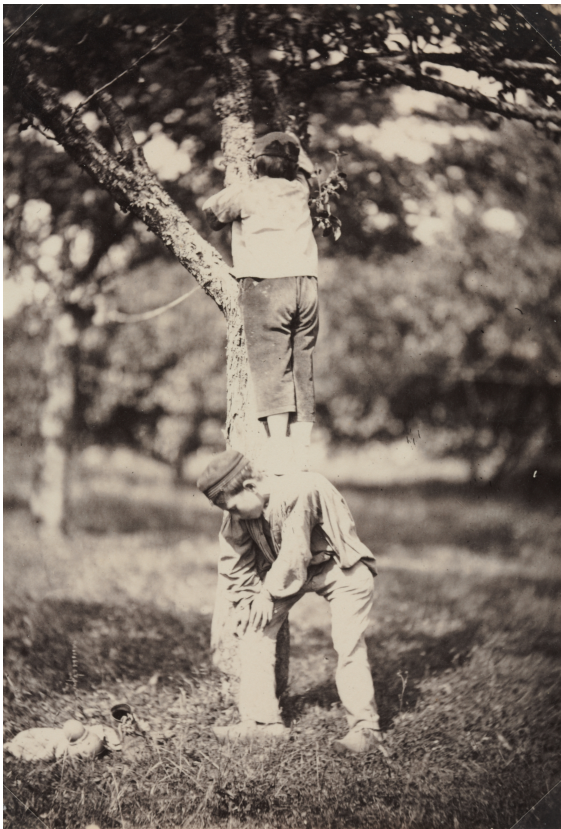
"French Country Study: Two Boys Climbing a Tree" by Auguste Giraudon, Public Domain < https://wndfx.link/ZYR7d >