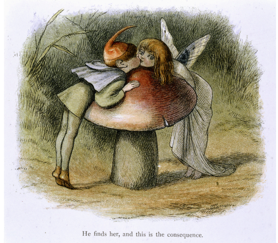
He finds her, and this is the consequence.

From In Fairy Land: A series of pictures from the elf-world by Richard Doyle, CCO < https://wndfx.link/Ya6NE >